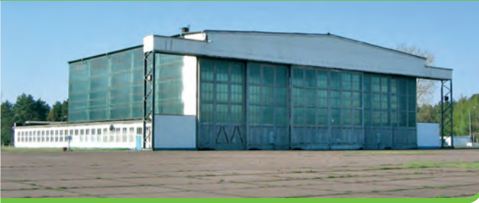
Hangar I 49 x 47 m/2,300 m 2 Höhe = 13 m